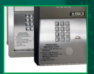
Flush or Surface mount available for 1802 & 1802-EPD, surface mount only for 1802-AP