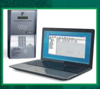
1802-AP PC Programmable free software download from doorking.com/software