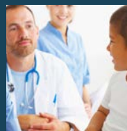
Nurse call and Communications