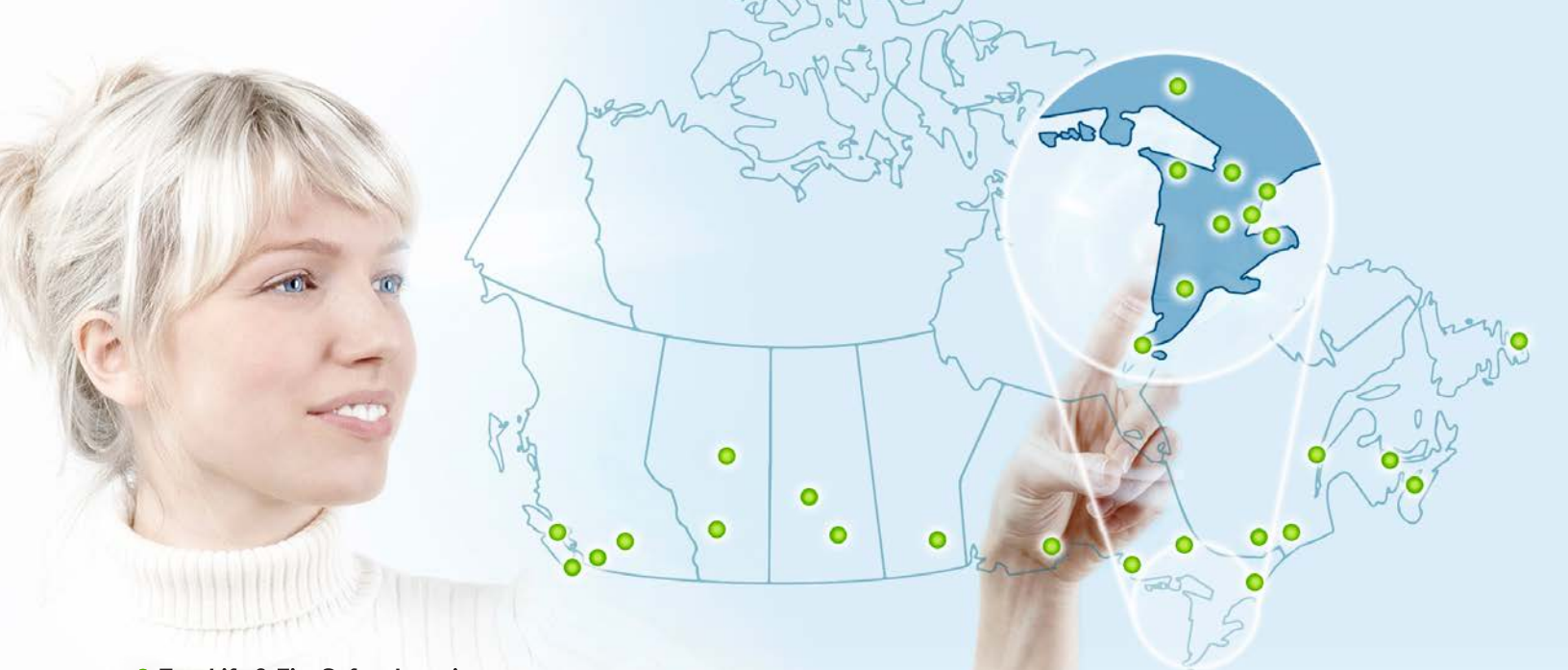
● Troy Life & Fire Safety Locations