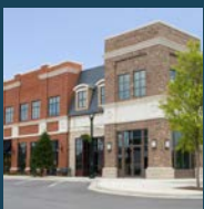
Fire Protection and Fire Safety Plans