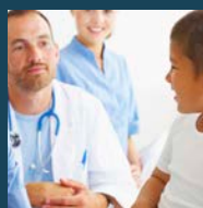
Nurse call and Communications